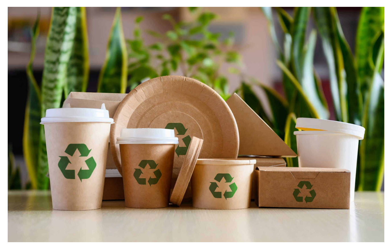
Market Leading Roll to Roll Manufacturer of Laminated & Coated Paper, Film and Non-Woven