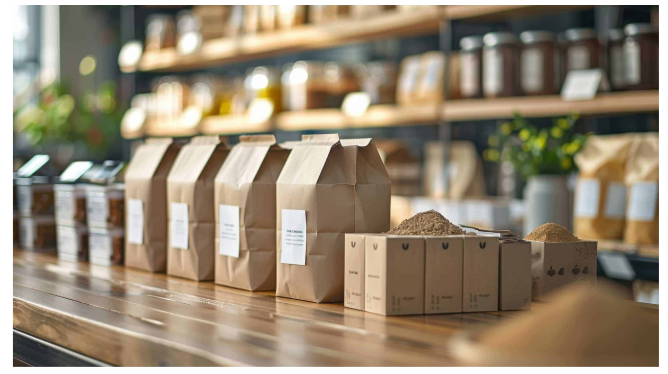
We Specialize in Developing Solutions